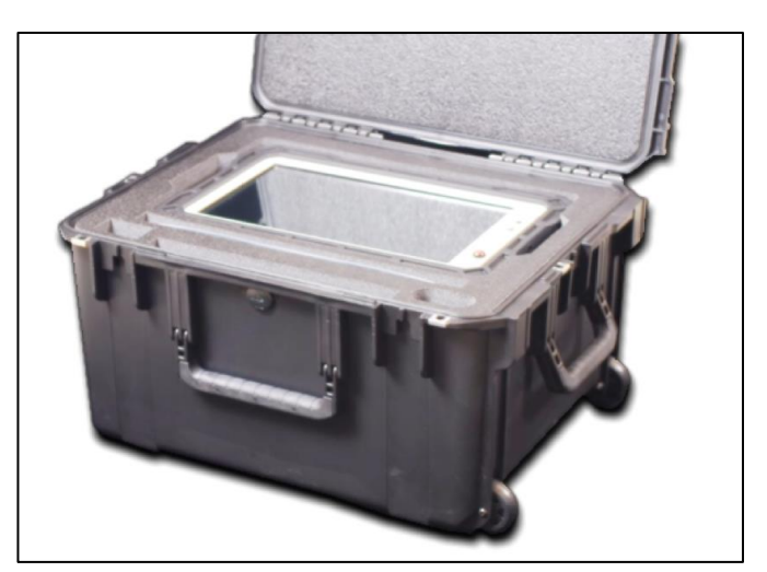
LP-5000™ Hard Sided Shipping Case