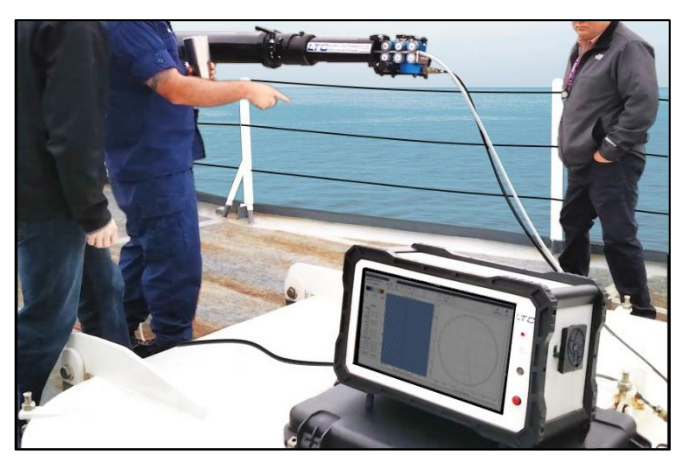
LP-5000™ deployed with BEMIS™ LC 76mm