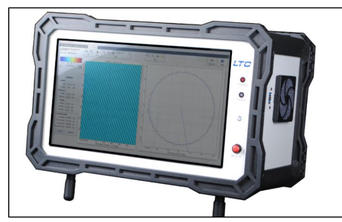
LP-5000™ Front View